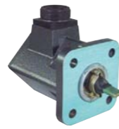
EFI67/1.50.16 a, b, ac, ad, ae