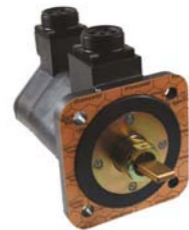
EFI61/2 S1 a, ad AC/pulse generator