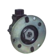
EF67/2.50.16 ad, ae