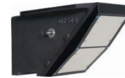
DRS05/1, DRS05/2 & DRS05/3

Beyond the proven use in the established means of transport the radar sensors can also be adopted to unconventional transport modes like suspension railways or monorail systems. The experienced engineers at DEUTA will be happy to advise you on any issues related to radar sensors, speed detection and odometry, even at early project stage.