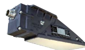
Radar sensor Doppler radar with dual antenna system

DEUTA offers you three groups of sensors which differ in their measuring principle: