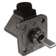
EFI50/1 S1 a, d AC/pulse generator