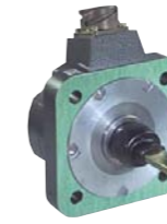
DF16/1 a, ac, ad, af, nf

All axle-mounted sensors can be supplied as multi-channel units. They can be customised to a certain extent with regard to the number of pulses, the phase relationships, and the output circuits.