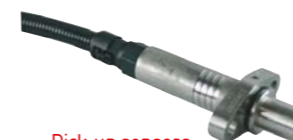
Pick-up sensors Hall sensor

The sensors operate contactless and measure the speed and distance over the ground by deploying the Doppler principle with an dual antenna system. The integrated digital signal processor performs sophisticated evaluation algorithms in the device.