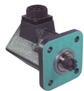
EFI67/1.20.16 a, ac, ad