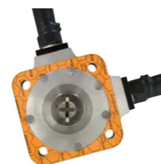
Axle-mounted sensors 1- to 4-channel pulse generator

Feature an extremely long service life because the space-saving sensors operate contactless and therefore with low wear.