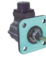
EF67/2.20.16 ad, ae