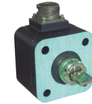
DF17/1 a, ac, ad, b