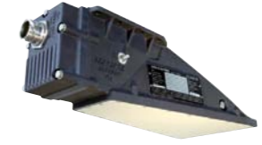
DRS05/1S1 & DRS05/3S1