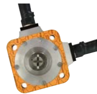
DF16/1 a, ac 1- to 4-channel pulse generator